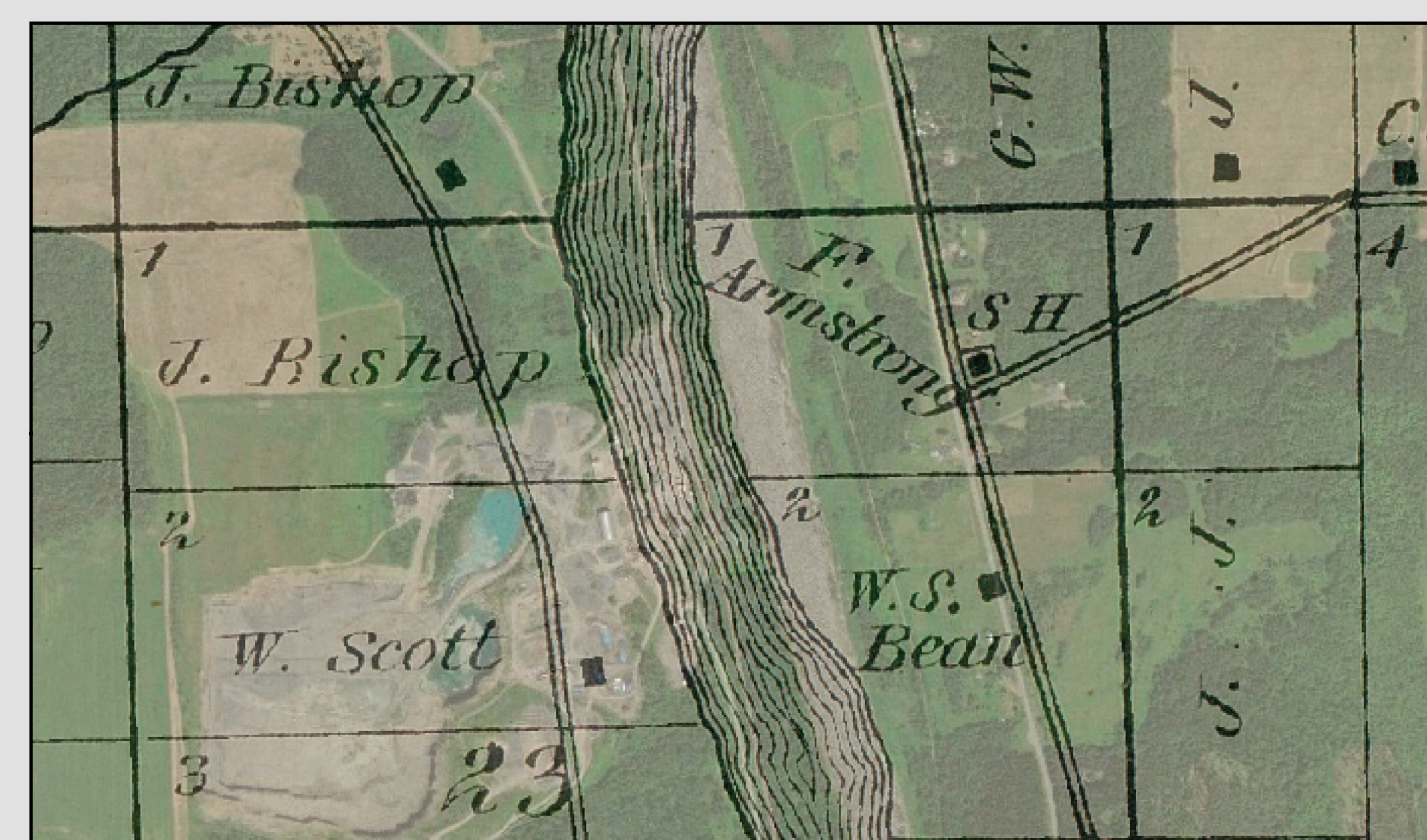
With the georeferenced map, we located the exact placement of the property of first pioneer of Maysville.